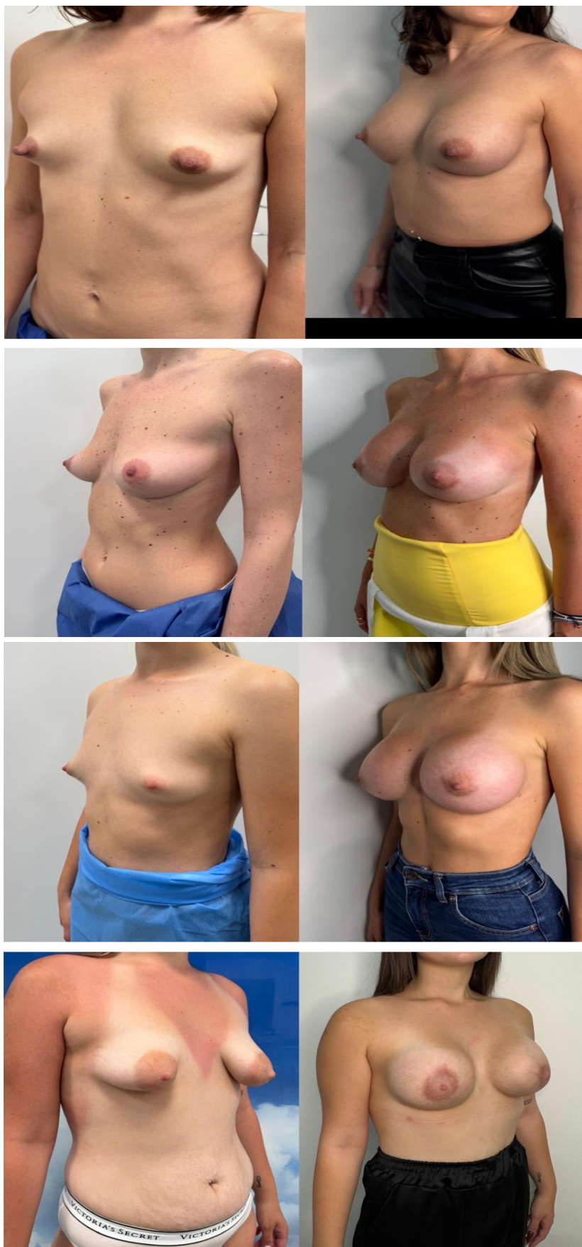
Figure 3: Pre and postoperative (e, f, g, h) views of 4 different patients with bilateral tuberous breast deformity. Postoperative photographs were obtained 1 year after single-stage correction using the star-like glandular incision technique combined with subs fascial high profile implant placement.